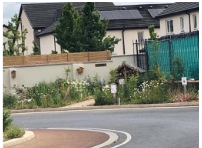
Some photos of our beautiful school garden

St Patrick's N.S. Parents' Association is a member of the National Parents Council Primary. Please see their website www.npc.ie for useful information and publications for parents. They also operate a helpline for parents on 01-8874477